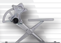
Power Window Regulator Assembly