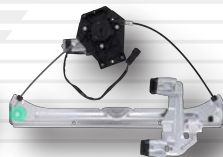
Power Window Motor & Regulator Assembly