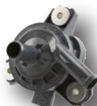
Inverter Water Pump