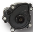
Electronic Water Pump