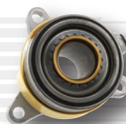
Concentric Slave Cylinder