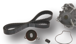
Water Pump Timing Belt Kit