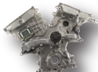
Timing Chain Cover