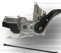
Power Back Door Actuator