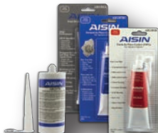
Form - In - Place - Gasket