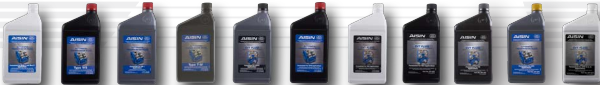
Automatic & CVT Fluids