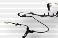
ABS Speed Sensors