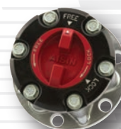
Free Wheel Hub