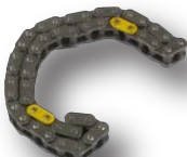
Engine Timing Chain