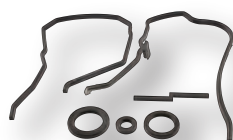
Engine Timing Cover Seal Kit